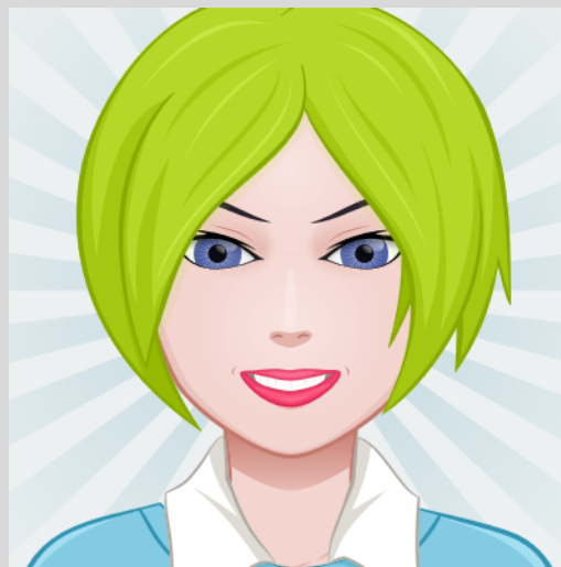
She was the English teacher.

It was on 8 March, when some children in the first year of primary school were teaching English in school in France and suddenly the teacher disappeared. The teacher has come a week ago, so she had been teaching only the previous few days. The previous days the children didn't feel comfortable with them because they saw something strange in her.