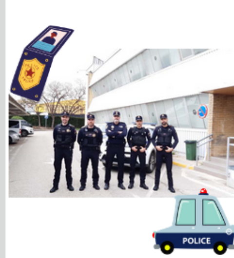
In the photo, the police was coming.

One of them thought: "It's better if we call the police". When the police came, they started investigating. And they closed the school. At 12:00 the next day, the police confirmed that she had disappeared and that this teacher must have magical powers.