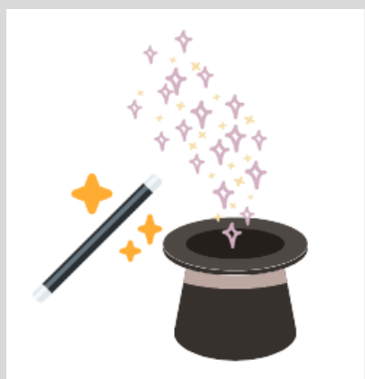
It was the objects that she used to make the trick.

The children thought that with this teacher it was not going to go well.