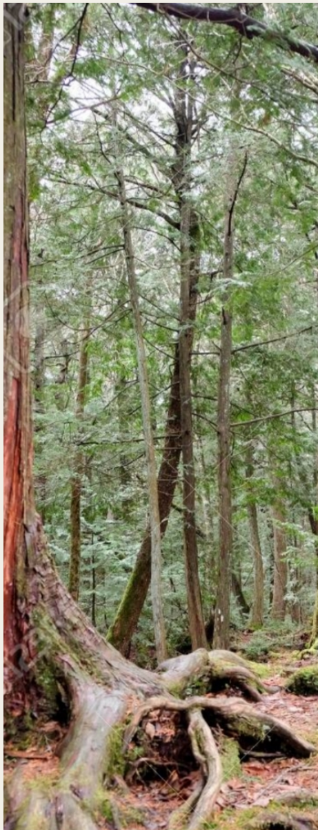
The Suicide Forest